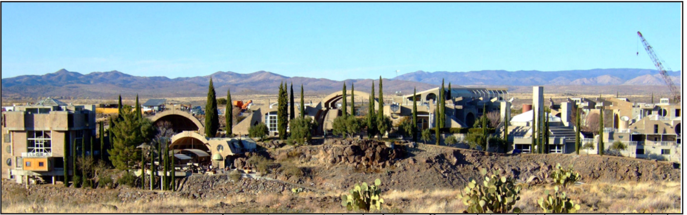
Arcosanti, a new city in the Arizona Desert, designed with community in mind